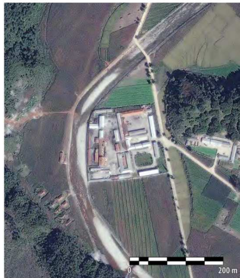
DigitalGlobe Natural Color Imagery, September 27, 2013 , 39.689814°, 126.857436°