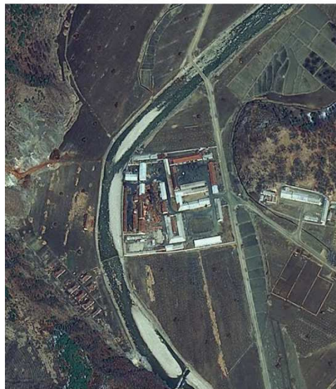
Natural Color Imagery, April 7, 2013, 39.689814°, 126.857436°