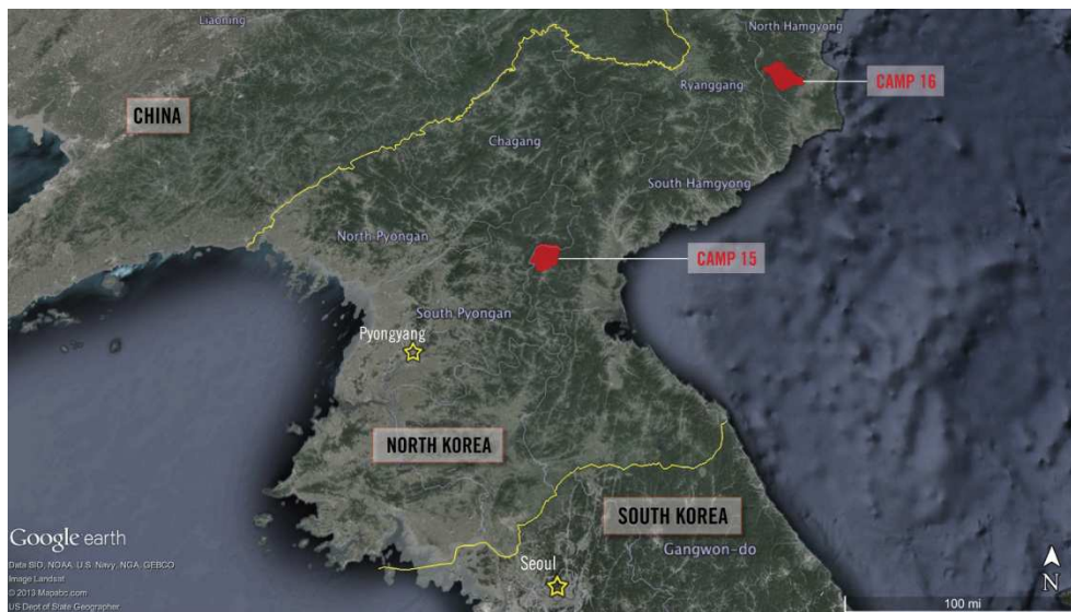
Map of North Korea and neighbouring countries with Camps 15 and 16 highlighted in red. Names and boundary representation do not necessarily constitute endorsement by Amnesty International.

Amnesty International's Science for Human Rights program commissioned satellite image analysis of kwanliso 15 (2011-2013) and kwanliso 16 (2008-2013) in order to assess the current state of these two political prison camps. Kwanliso 15 is located in Yodok, South Hamgyong province around 120km from the capital Pyongyang and kwanliso 16 in Hwaseong, North Hamgyong province is approximately 400 km from Pyongyang.