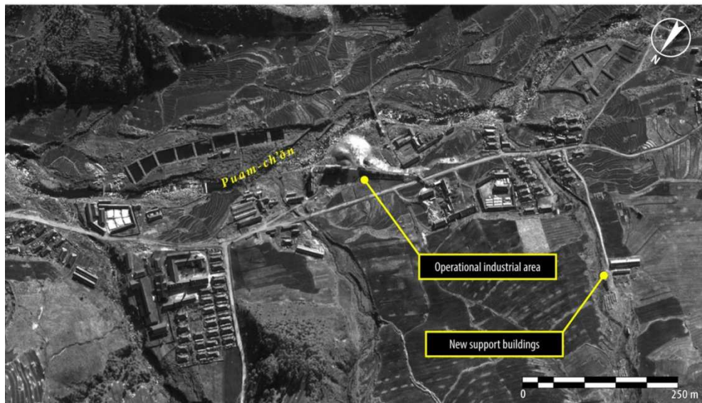
Panchromatic Imagery, November 18, 2012, 41.261302°, 129.375145°