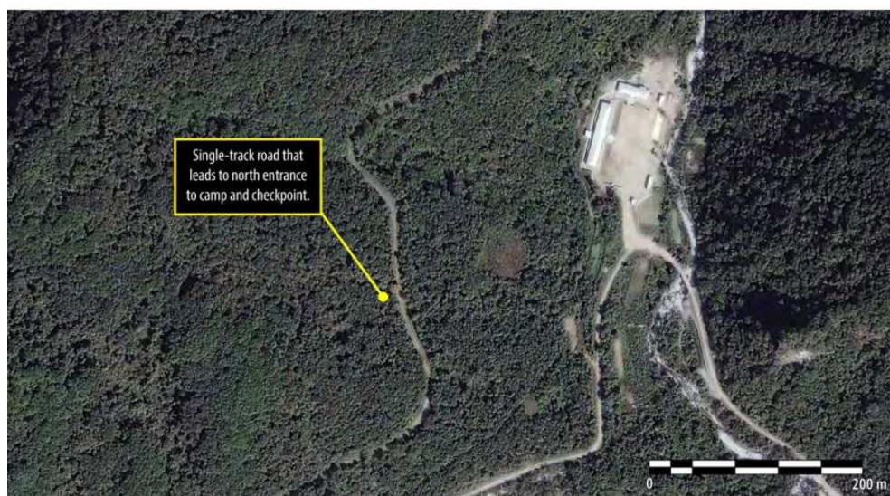
DigitalGlobe Natural Color Imagery, September 27, 2013 , 39.839914°, 126.802832°