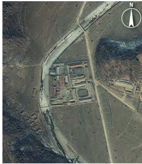
DigitalGlobe Natural Color Imagery, February 22, 2012 , 39.689814°, 126.857436°