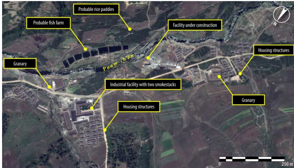
June 11, 2010, 41.261302°, 129.375145°

Satellite images further show investment in and maintenance of production facilities, focused on mining, agriculture and logging. A 2010 satellite image captures the construction of a new facility within kwanliso 16. In the image further below from November 2012, the industrial facility appears to be operational and new support buildings are visible.