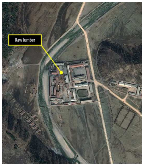
March 26, 2011, 39.689814°, 126.857436°

This satellite image time series from 2011 to 2013 shows a probable furniture factory within kwanliso 15 (Area 4 of overview image on page 14). The change in lumber piles is indicative of production activity.