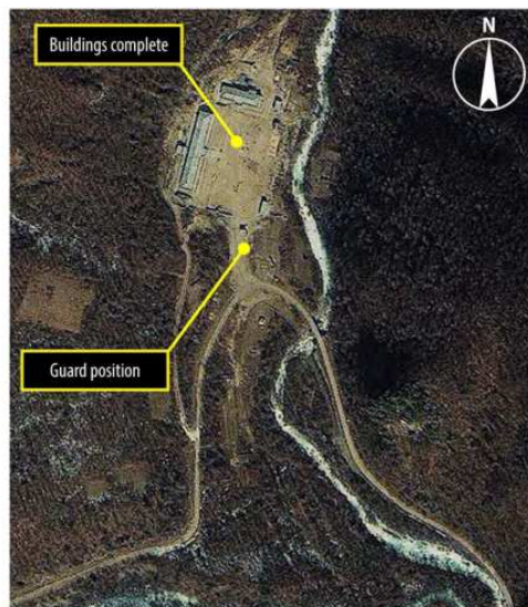
DigitalGlobe Natural Color Imagery, February 22, 2012 , 39.839914°, 126.802832°