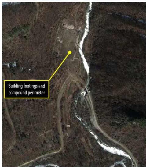
Natural Color Imagery, March 26, 2011, 39.839914°, 126.802832°

The images that are featured below from kwanliso 15 (Yodok kwanliso ) show an administrative compound (located in Area 6 of the overview image on the following page) that was constructed (or reconstructed) between March 2011 and February 2012. Exact functionality of the complex is unclear, but it is likely to be either a guard station or an administrative area to support logging activities.